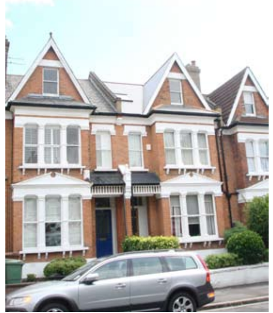
Street view on completion of work

The main requirements were to make the rear elevation workable without undue impact on neighbours or daylighting. The party wall could not be raised as this would require a planning application. The volume of extension was carefully dimensioned to maximise the available internal space.